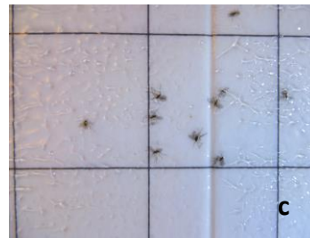
Figure 5. (a) Each swede midge trap is placed on a stake and hangs no higher than 25 cm from the ground. (b) The lure is positioned on the inside ceiling of the trap and is replaced every 4 weeks. (c) A sticky lining is positioned in the floor of the trap and are checked and replaced at least twice a week, counting the number of midge found per trap per day.

Swede midge traps can be purchased at Solida: www.solida.ca . For each field, monitored for an 8 week period, the following supplies are required: