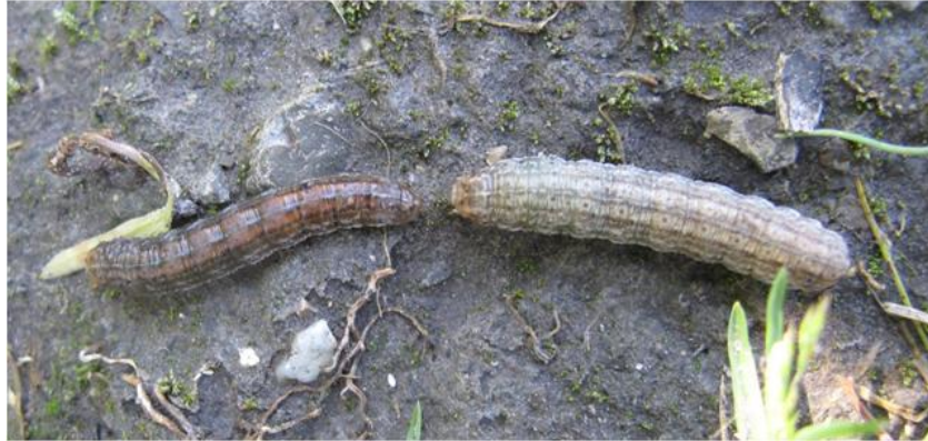
Figure 3. Redbacked (left) and darksided (right) cutworm larvae (MAFRI-Gavloski).

Pupae: Pupation occurs in a reddish-brown puparium that is formed within an earthen cell 3-8 cm below the soil surface (Figure 3).