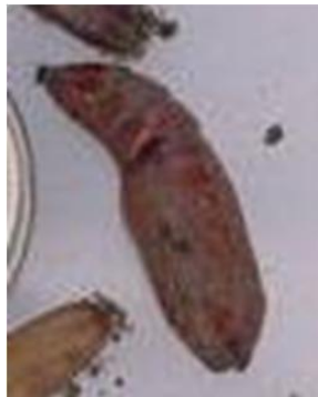
Figure 4. Reddish-brown redbacked cutworm pupa measuring approximately 20 mm long (AAFC-Otani).

Pupae: Pupation occurs in a reddish-brown puparium that is formed within an earthen cell 3-8 cm below the soil surface (Figure 3).